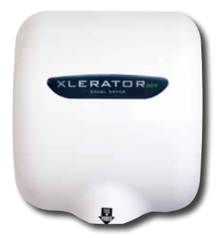
Model XL-BW eco

Zinc die-cast cover, textured graphite epoxy paint, automatic sensor, surface mounted.