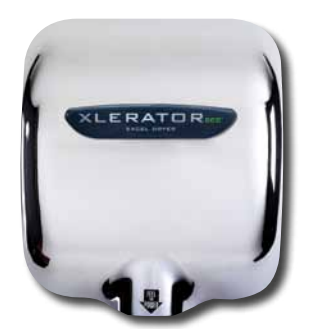
Model XL-C eco

White Polymer (BMC) Cover, automatic sensor, surface mounted.