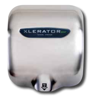
Model XL-SB eco

Zinc die-cast cover, chrome plated, automatic sensor, surface mounted