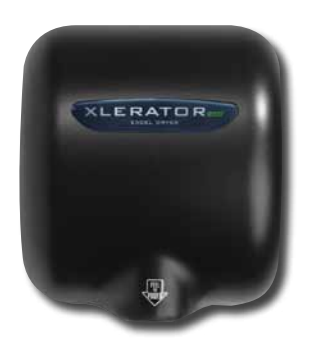
Model XL-GR eco

Zinc die-cast cover, textured graphite epoxy paint, automatic sensor, surface mounted.